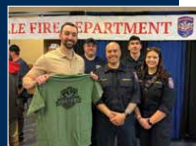
At the Monroeville Fire & EMS Show

Eos currently operates two facilities in Turtle Creek, located in the 25th Legislative District. The company manufactures American-made zinc-based batteries that support clean energy systems and domestic supply chains.